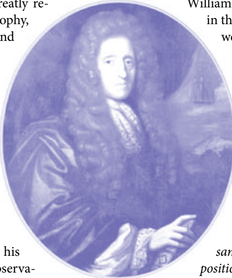
John Locke, oil on canvas by Herman Verelst, 1689; in the National Portrait Gallery, London.

Do I propose, then, that every citizen shall be free to follow his own reason, and believe whatever this enlightened or deluded